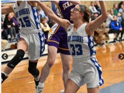
High School Sports Blog