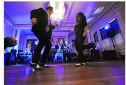
Winter in the City, a fundraiser for Scranton Tomorrow, will be held at Posh at the Scranton Club.