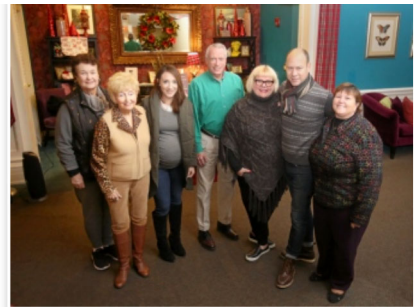
Image Gallery for Winter in the City fundraiser a highlight of the season

Details: Admission costs $25, and tickets will be available at the door. Proceeds benefit Scranton Tomorrow. For more information, call 570-963-5901 or visit