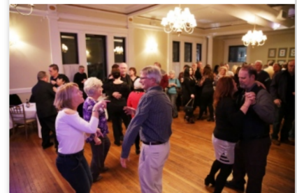
Winter in the City, a fundraiser for Scranton Tomorrow, will be held at Posh at the Scranton Club.